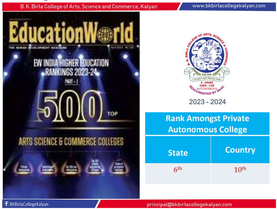
Ranked No. 10<sup>th</sup> in Country and 6<sup>th</sup> in Maharashtra in 'Private Autonomous College' by EducationWorld Rankings 2023-24